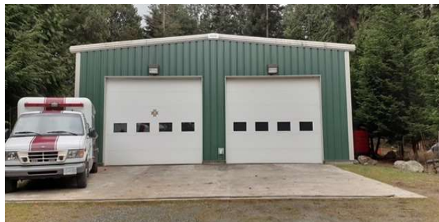
Emergency Services Building 2 (ESB#2) 646 Tumbo Channel Road (East Point)

The Saturna Island Fire Protection Society (SIFPS) manages and oversees how property taxes, collected locally on Saturna, are used for training medical first responders and firefighters; the purchase and maintenance of emergency equipment; and the operation and maintenance of the Emergency Services Buildings. Society documents, including financial reports, can be found on the website at sifps.ca .