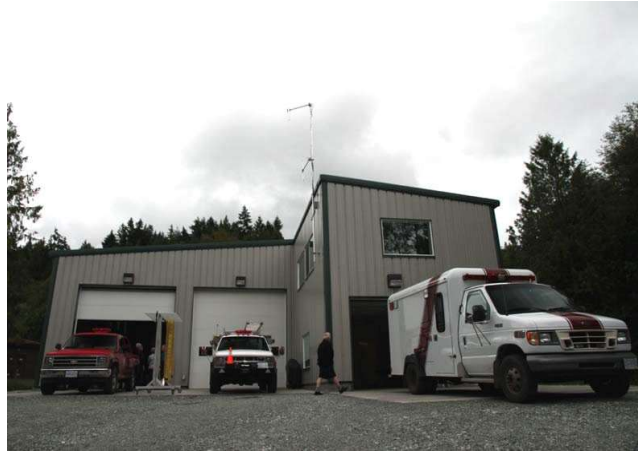
Emergency Services Building 1 (ESB#1) 102 Harris Road (across from the store)

http://www.sifps.ca/emergency-disaster-preparedness-teams-on-saturna/